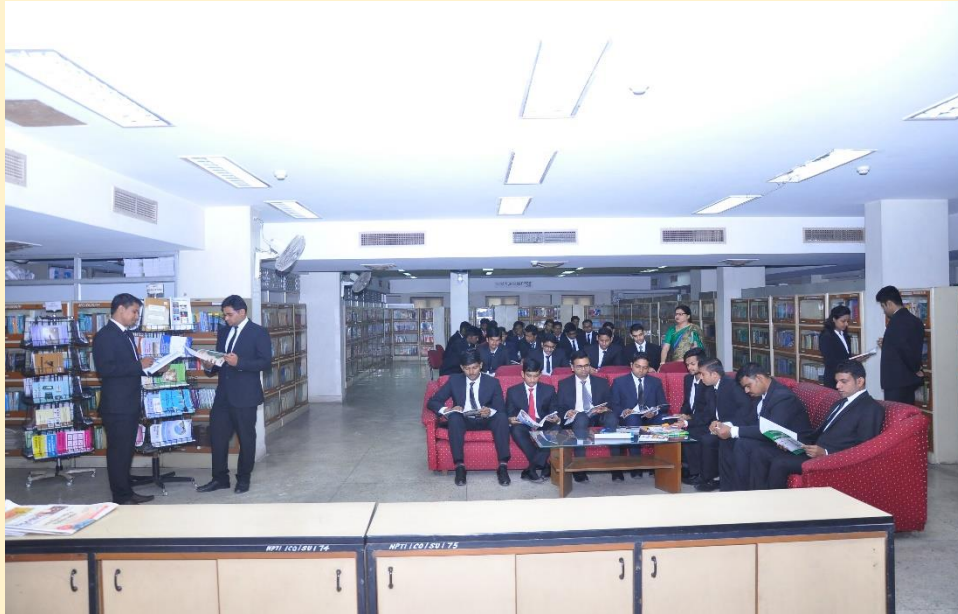
Students at NPTI Library

With a view to build adequate technical capacity and develop economically viable Energy sector and energy efficient systems and compliance of laudable objectives of the Govt. of India, adequate scientific, technical manpower at all levels is a pre-requisite. The main aim of the courses is to create a pool of technically trained manpower readily available for recruitment to the State, Central and Private Power Utilities and allied Industries.