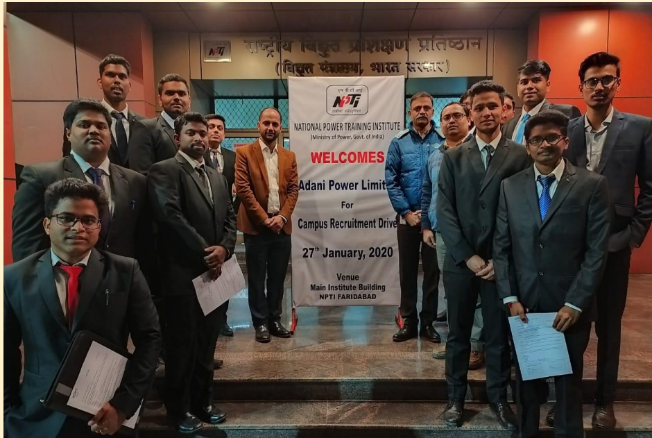
PGDC Students during Campus Placement