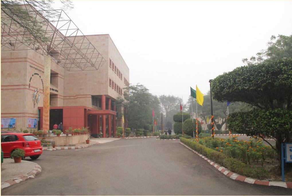
NPTI Corporate Office, Faridabad, Haryana.