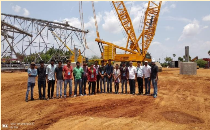
Onsite Visits of PGDC Students