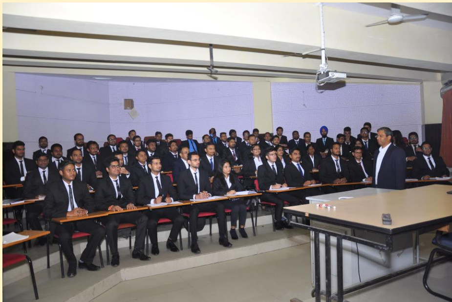
PGDC Students in Classroom

The modules of the courses are listed in the detailed curriculum. The sequences of these modules are not rigid and may be modified suiting to requirements of power companies, from time-to-time.