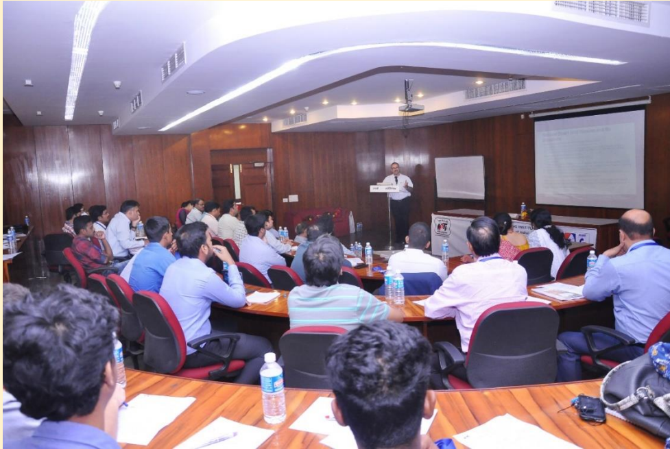
PGDC students attending Workshop at NPTI

Grid have been established at NPTI's various institutes. NPTI also provides consultancy to the Utilities on training and technical problems including setting up of Plant Level/State Level Training Institutes. The Regional Institutes are conducting large number of long-term and short-term courses every year. Long-term courses (52 weeks) cover the mandatory requirements under Indian Electricity Rules. In addition, these institutes are also conducting on plant/on-site training programs as per the need of the Power Sector organizations. Since inception of this organization over 4,70,000 personnel at various levels have been imparted training by the Institutes of NPTI.