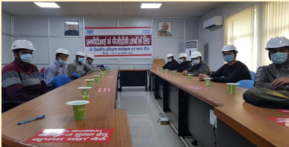
Students at Plant Visit