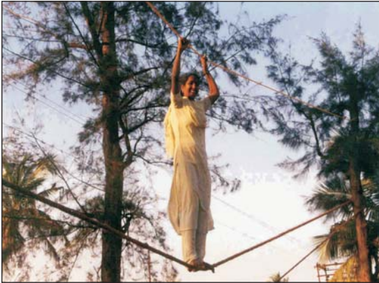
Village Volunteer being trained in Search and Rescue

The selected team members need to be well trained in specific skills so as to carry out their specific tasks efficiently during a given situation of a disaster. The DMTs, which need to be well trained, are: