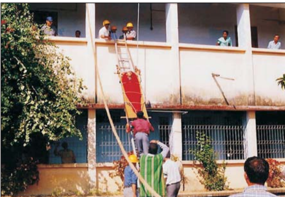
Village DM Team Carrying out Mock Drill