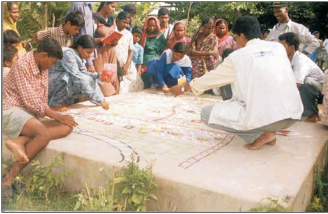
The picture is a Resource map prepared by the community under the Village Plan of Assam. Map shows the location of human resources, equipments to be used during emergency, open spaces etc.