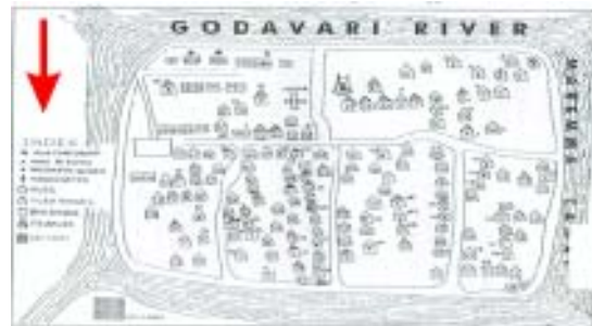
Social map of Pathapeta village

Form a group of 10 students and draw a social map of your locality showing the households, community places, roads etc. give symbols to each item demarcated in the map as shown in the map on your right.