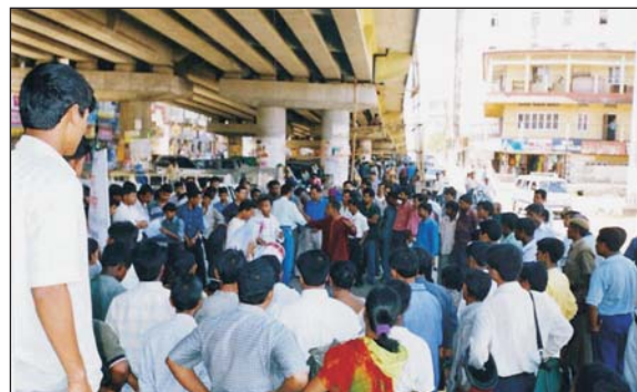
Street play in an urban area to sensitize the community