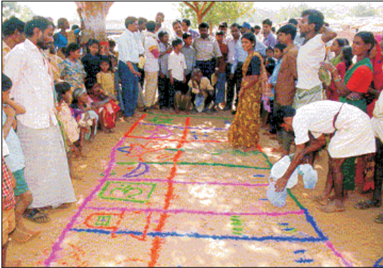
Mapping exercise of a village in progress

One of the most important activities of preparing the Disaster management plan at the village level is the mapping of risk, vulnerabilities and capacities of the village by the community itself as it is a simple and cost effective tool for collecting ground level data. This is done through Participatory Rural Appraisal (PRA) exercise. This mapping exercise aims to provide a pictorial base to the planning process especially to the semi-literate populace and ensures maximum community involvement across gender, caste and other divides. The villagers/community members are encouraged to draw the maps on the ground using locally available resources such as stones, colour powders etc. for different items and indicators. The types of maps are as follows: