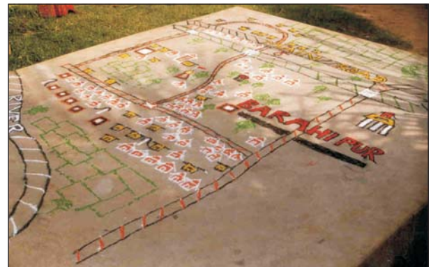
Vulnerability Map of Barahipur Village