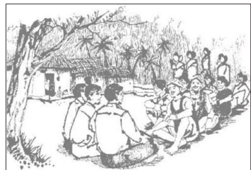
People in group discussion