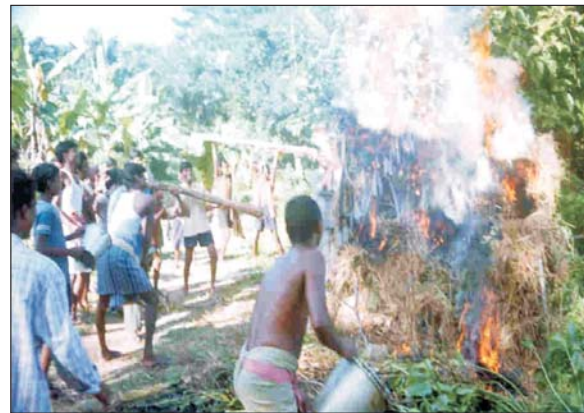
Village Task force members doing Mock Drill on measures to be taken during fire incident

It is important to conduct live disaster situation drills/rehearsals. Mock drill is an integrated part of the disaster preparedness plan, as it is a preparedness drill to keep the community alert.