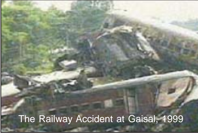
The Railway Accident at Gaisal, 1999

“We saw railway coaches piled up like a multi-storey building. The one on top was burning.”