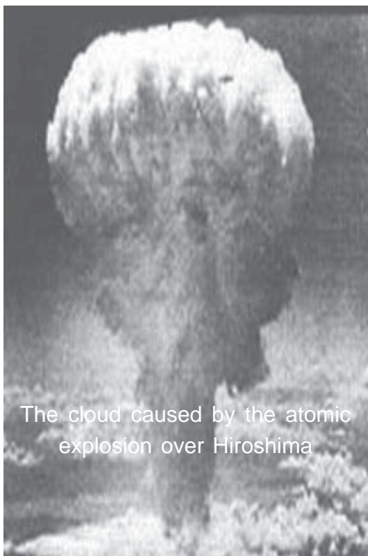
The cloud caused by the atomic explosion over Hiroshima

On August 6, 1945, an American B-29 bomber, the "Enola Gay" dropped an 8,900-pound atomic weapon over the city of Hiroshima. Two thousand feet above the ground, the bomb, dubbed "Little Boy" detonated, instantly leveling almost 90% of the city. The destruction was incredible. More than 10 square kilometers of the city were instantly and completely devastated; a City center was literally vaporized. The ensuing fireball spread and engulfed many more kilometers of the City in fire. 66,000 people were killed, and 69,000 injured