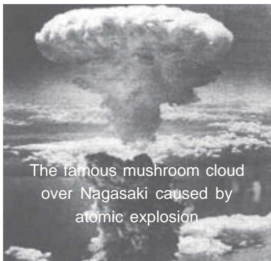
The famous mushroom cloud over Nagasaki caused by atomic explosion

With the advancement of scientific research in the world, several countries have acquired the technology to produce Nuclear Arms, which are more destructive and harmful than the atom bomb used more than half a century ago. There is also a risk of accidental exposure to harmful radiation from the several nuclear reactors that are used for generation of power. Theft of nuclear material can enable the creation of crude bombs commonly known as 'dirty bombs' which can be used by anti-social elements or terrorists.