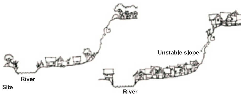
Figure 1.3 : Site after pressures from population growth and urbanization

Socio-economic Vulnerability: The degree to which a population is affected by a hazard