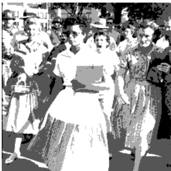
Fig 21.1 : Photograph by Will C. of Elizabeth Eckford a black girl attempting to enter Little Rock School on 4th September 1957.

The world during the first half of the 20th century was dominated by the great wars, revolutions, emergence of German Fascism, Soviet Socialism, Western liberalism, national liberation movements etc. However, with the end of the Second World War and the independence of colonies and semi-colonies like India, China, Indonesia, Nigeria and Egypt by mid 1950's a new era began in the world. This was an era of economic growth and prosperity for most of the countries, but also of growing tensions in many countries. Sections of societies which had long been denied equal rights came out asserting their rights.