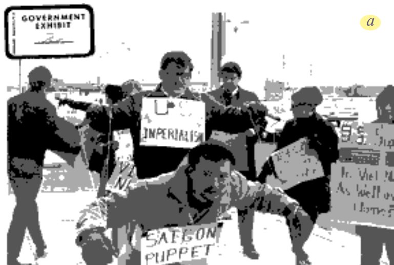
Fig 21.3: a. Vietnam War protesters; b. female demonstrator offers a flower to military police on guard at the Pentagon. Discuss the ideas in these images.

As a result of these pressures the USA and USSR, the main competitors in the arms race, began talks to cut down their nuclear arsenal - Strategic Arms Limitation Talks (SALT) which however were unsuccessful. Finally a treaty was signed in 1991 which is called Strategic Arms Reduction Treaty (START). START negotiated the largest and most complex arms control treaty in history, and its final implementation in late 2001 resulted in the removal of about 80 percent of all strategic nuclear weapons then in existence. A little after the signing of the treaty the USSR was dissolved and in its place a new Russian state was formed. With this ended the long period