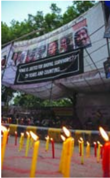
Fig. 21.4 Bhopal gas tragedy being commemorated

While they have succeeded to some measure, they are still a long way before they can claim to have achieved all the major demands. While enormous sums have been spent on setting up medical facilities in Bhopal, the victims are still suffering from its effects; compensation has been paid not as per international standards and that too not properly to all the affected people; the government failed to prosecute and punish the management of the company for its negligence which led to the accident. We do have better laws today, yet we still do not have a proper policy or adequate impartial inspecting mechanism which will eliminate the possibility of such disasters in the future. The protest against this has been even more complex since the company itself was based in USA. People today need to use international laws to fight against the problems that the factory workers and women who are affected by the pollution created by the company. Many people across the globe boycotted products made by the company. Today social mobilisation continues when the Dow company sponsored Olympics in London and people across the globe signed petition against it. Multiple organisations from around the world pointed at the unethical alliance of Olympic body with Dow.