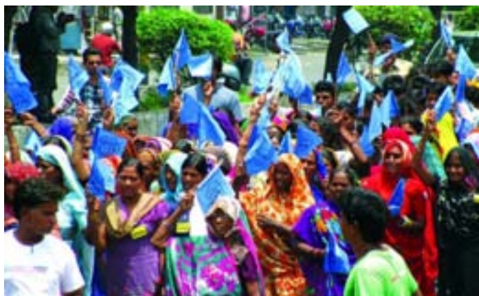
Fig. 21.5 Protest in Narmada valley against

Initially the Sardar Sarovar Project was expected to be built with money borrowed from World Bank. After intense protests, mobilisation, marches, hunger fasts and an international campaign World Bank decided to withdraw its funding.