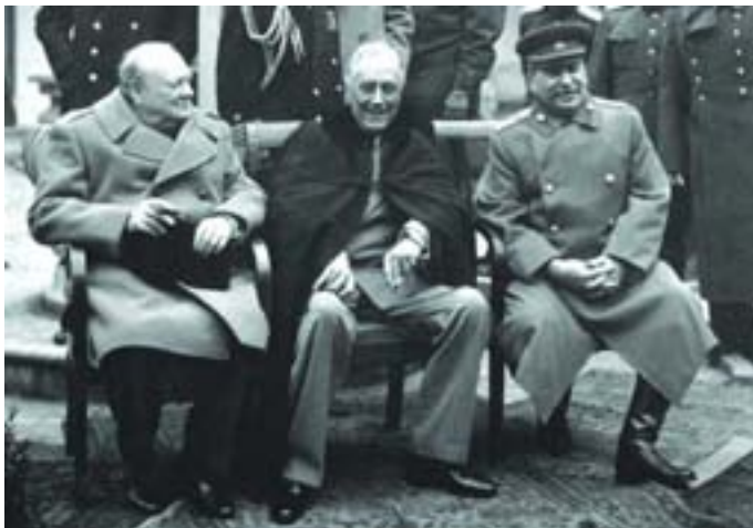
Fig 14.7: (TOP) from left Churchill, Roosevelt and Stalin at Yalta Conference

The first half of the 20th century ended with the nightmare of Hiroshima and Nagasaki and with the hopes generated by the founding of the UNO. Just as the First World War saw the end of large monarchic empires the Second World War also ended with ending of large colonial empires of the Britain, France, Japan, Italy and Germany. By 1950 countries like India, China, Indonesia, Vietnam, Egypt, Nigeria etc