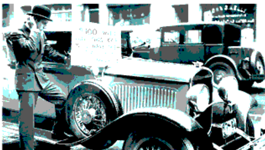
Fig 14.4 : A New Yorker offers to sell his roadster after losing his money in the stock market crash.

Roosevelt who became the President of US announced “the New Deal” which promised Relief to the victims of depression, Reform of financial institutions and steps to ensure economic Recovery (The Three Rs) by undertaking large public works. However, the real break came from the outbreak of war when state expenditure on armies and armaments suddenly increased giving a big boost to factory production and demand for farm produce. He also introduced the much needed social security system in the US. It established a permanent system of universal retirement pensions (Social Security), unemployment insurance, and welfare benefits for the handicapped and needy children in families without father present. It established the framework for the U.S. welfare system. In fact Great Britain had taken the lead in this direction even before the Depression when the war was still on. These basically consisted of unemployment insurance and old age pension schemes. At the close of the Second World War Britain too adopted extensive social security measures like unemployment doles, sickness coverage, health schemes, Child care etc. All this went on to make the idea of Welfare State in which the state ensured a certain basic