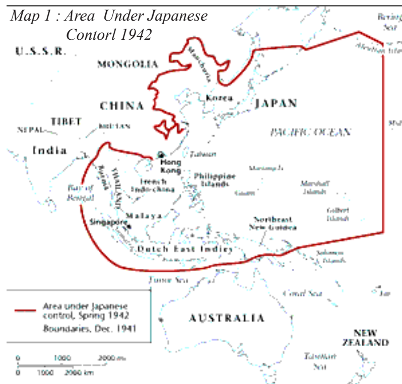
Map 1 : Area Under Japanese Control 1942

The tide of initial victories scored by German armies was turned back after the defeat of the German forces in the famous Battle of Stalingrad in early 1943. Now USSR and the Allied forces closed in on Germany. Soviet forces were welcomed all over Eastern Europe as liberators from the hated Nazi rule and eventually captured Berlin, the capital of Germany. Hitler and