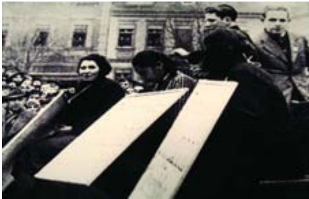
Fig 14.5 : Women accused of protecting Jews being publicly punished.

'The woman is the most stable element in the preservation of a folk...she has the most unerring sense of everything that is important to not let a race disappear because it is her children who would be affected by all this suffering in the first place...That is why we have integrated the woman in the struggle of the racial community just as nature and providence have determined so.'