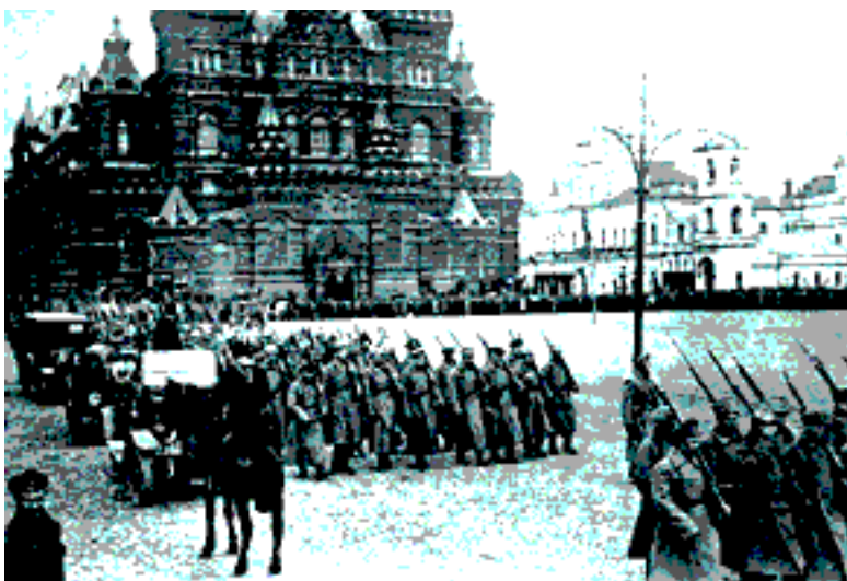
Fig 14.1 : Bolsheviks marching on red square, Russian Revolution of 1917

A bigger revolution was made later in October 1917 and it was not spontaneous. The liberals and aristocrats, who ruled Russia after the abdication of the Tsar, decided to continue the War to preserve the honour of the fatherland.