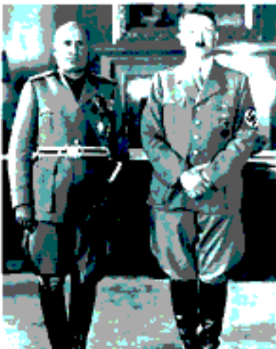
(Left) Two dictators: Mussolini and Hitler