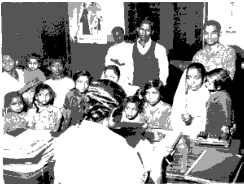
Fig 18.6 : Family Planning Clinic in Calcutta (Kolkata).

The judiciary however had other ideas regarding the policies and programmes. The Supreme Court was afraid that the Constitution was being amended rapidly in the name of achieving social and economic change was actually disfiguring it and unbalancing the existing relations between different institutional structures. In 1973, the Court came up with the landmark decision on the Basic Structure of the Constitution, which put a check on the governmental power to amend the Constitution.