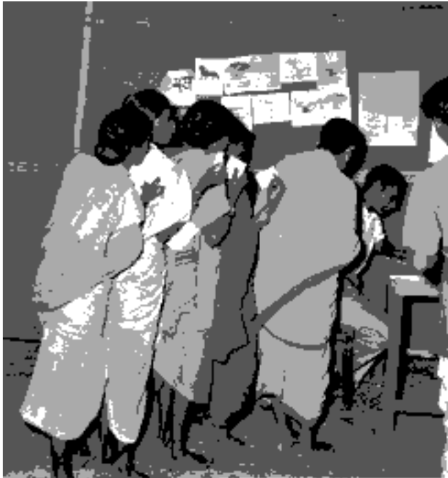
Fig 18.1 : Voting in first general elections

The first general elections to be held under the new Constitution were immensely significant for Indian democracy. It represented India's determination to take the path of democracy after independence from British rule. India adopted Universal Adult franchise at one go, unlike in the West where franchise was extended in stages, first to the propertied and only subsequently to other sections of society. For instance women in Switzerland got the right to vote only in 1971.