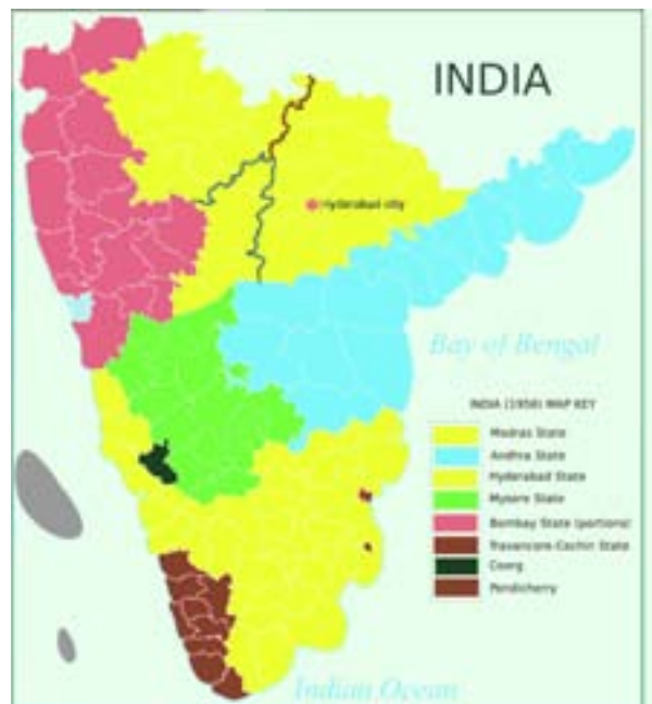
Map 1 : A graphic representation of various regions in the southern peninsula before State reorganisation.

The most vigorous of all the movements was that of the Telugu speakers which called upon the Congress to implement the old resolutions in favour of linguistic states. The Andhra Mahasabha had been active even during the British rule and was attempting to bring together the Telugu speaking people in the Madras presidency. This movement continued even after independence. The methods used included petitions, representations, street marches and fasts. Given the Congress opposition to this demand, the party did badly in the Telugu speaking areas in the first elections. The seats went to parties who supported the linguistic movement.