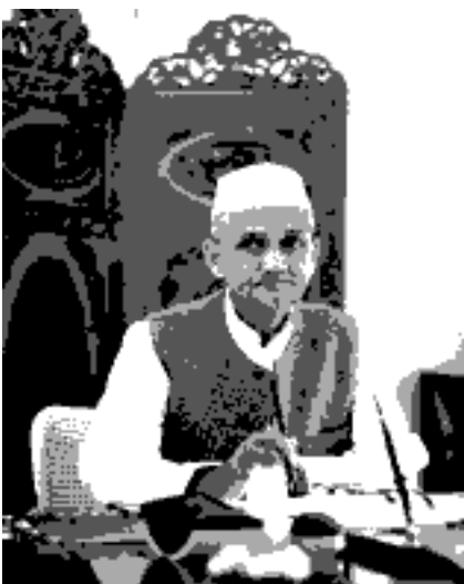
Fig 18.4 : Lal Bahadur Shastri

With the death of Nehru in 1964, critics raised doubts as to whether democracy itself would survive, or would it like other countries lose its democratic ethos?