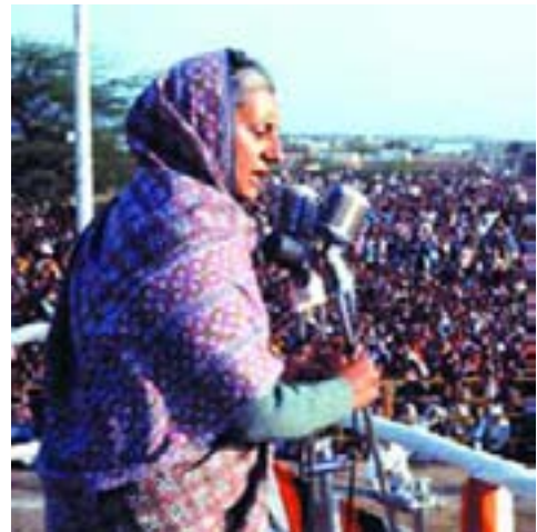
Fig 18.5 : Indira Gandhi

In Assam, a new state called Meghalaya was created in December 1969 out of the tribal districts of Khasi, Jaintia and Garo hills. Punjab, despite being formed in 1966 did not have a capital of its own. During the period 1968-69, there were a series of demonstrations asking for Chandigarh which served as the common capital of Haryana and Punjab to be given to them. In Maharashtra, there was curious demand of Bombay for Maharashtrians only. This was led by the Shiv Sena. The main target of this party was the South Indians who the party believed was cornering all the employment in the city.