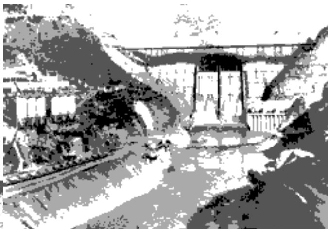
Fig 18.3 Bhakra Dam under construction during 1960. This was one among the first dams India built after Independence. (below) Image of an adult literacy class from early decades. Discuss how different ideas of development or changes in society are reflected with these projects.