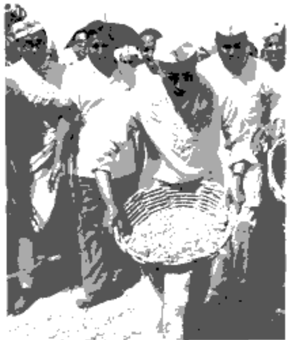
Fig 18.2 : Jawaharlal Nehru inaugurating a road in early 1950s

of very large states like Central Provinces and Berar. A large part of the country was under princely states. In each of these people speaking many different languages were living together. For example, Madras Presidency had in it people speaking Tamil, Malayalam, Kannada, Telugu, Gondi and Oriya languages. All people speaking a language and living in contiguous areas demanded to be organised under one state. These included the campaign for Samyukta Karnataka (uniting Kannada speakers spread across Madras, Mysore, Bombay and Hyderabad), Samyukta Maharashtra, the Mahagujarat movement, the merger of Travancore and Cochin princely states and the state of Punjab for Sikhs. Will agreeing to these demands help to build the unity of the country or will it lead to the breaking of the country along linguistic lines was the main concern?